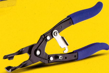
Valve Stem Seal Pliers With Spring