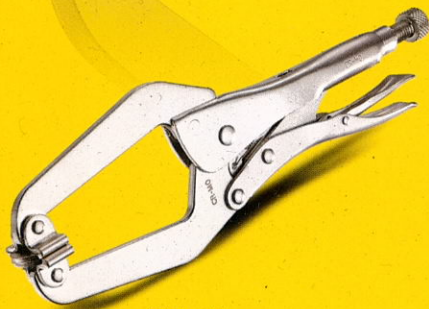
12" Locking C-Clamp W/Pad