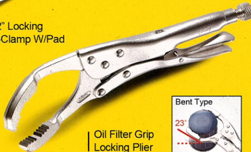
Oil Filter Grip Locking Plier